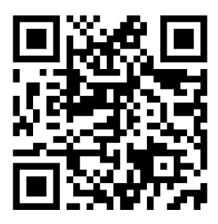
Scan this code to access crisisbase, local, & preventative stress reduction techniques